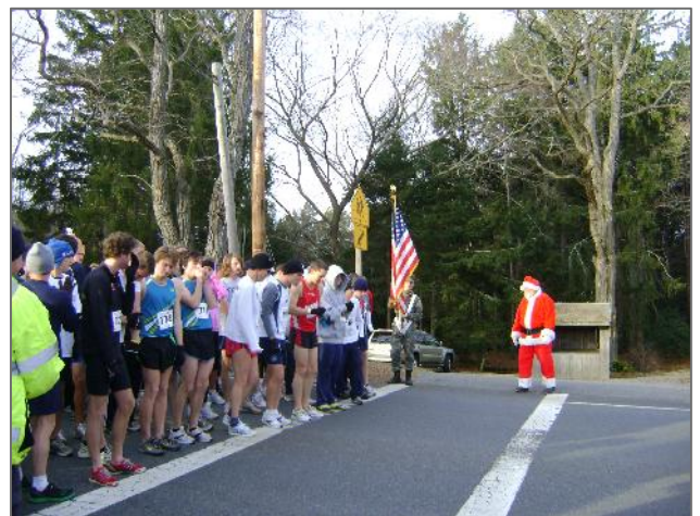
Santa appears at the starting line on Thanksgiving Day

Thank you so much for making my life a little easier. Your generosity is greatly appreciated!